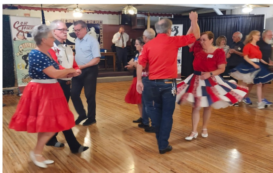
Cowtown Singles 4th Sunday May Dance