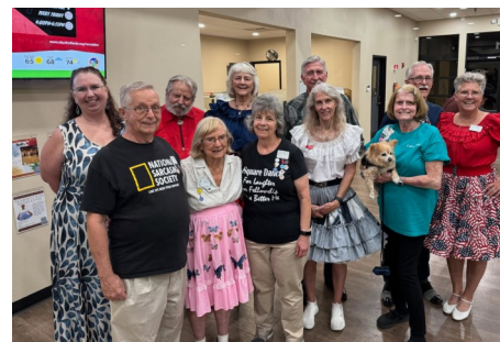
Cowtown Singles visiting Quails