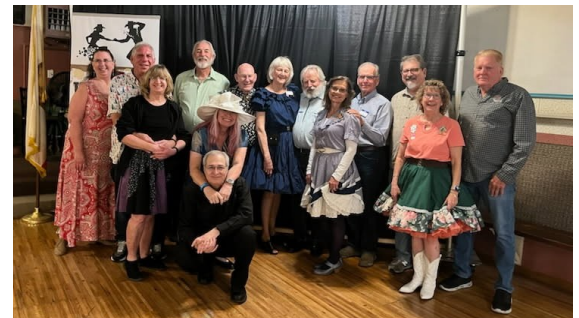
Quails at Cowtown Singles 1st Friday May Dance