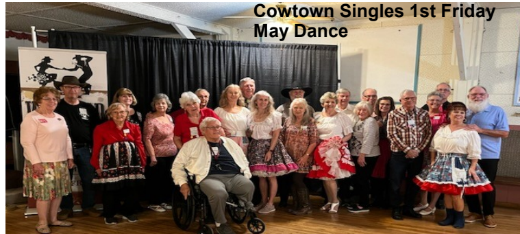
Cowtown Singles 1st Friday May Dance