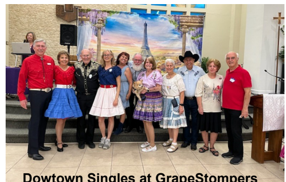
Downtown Singles at GrapeStompers