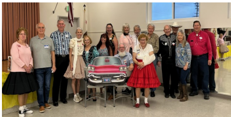
Cowtown Singles at Twirlers