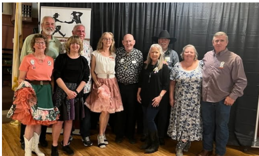
Grapestompers at Cowtown Singles 1st Friday May Dance