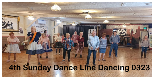
4th Sunday Dance Line Dancing 0323