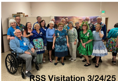
RSS Visitation 3/24/25