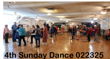
4th Sunday Dance 022325