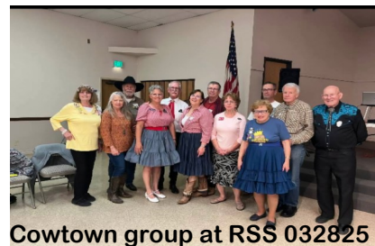
Cowtown group at RSS 032825