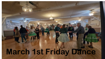
March 1st Friday Dance