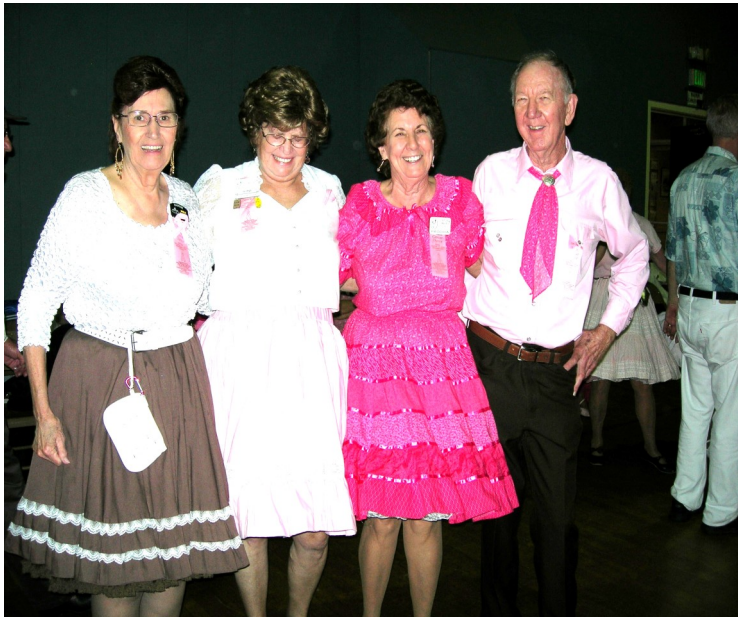
Cancer Dance 2010