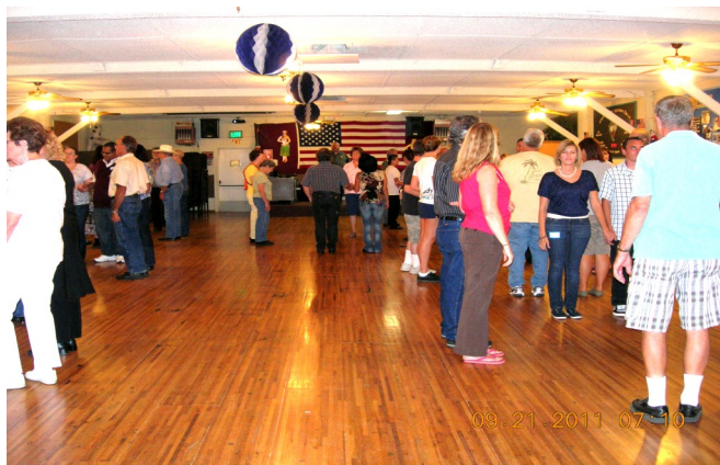
New class 9-21-2011