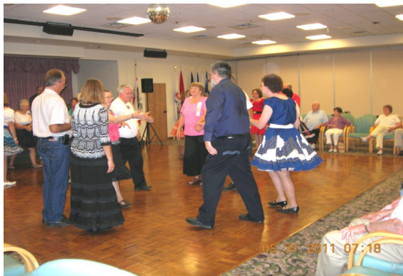
Club demo at Air Force Village West