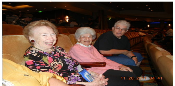
The young lady in pink turned one hundred years young on the cruise and still square dances.