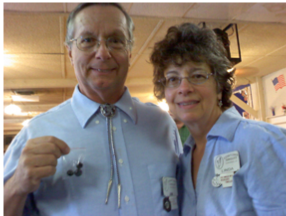
Berries for the Sunday dance!!!!