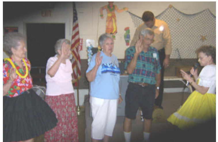
Swearing in of new officers, July 15

Admission to Cowtown Singles Dances, as of September 1 st will be $6 per person.