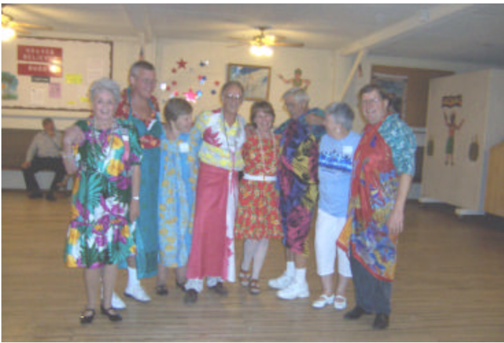
Having fun at the Luau Dance, July 15

Also please don't forget that October 7 will be our Chili Cook off and a POTLUCK. So, even if you don't make chili, please bring something to go with it. Thanks again to all of you for the wonderful help.