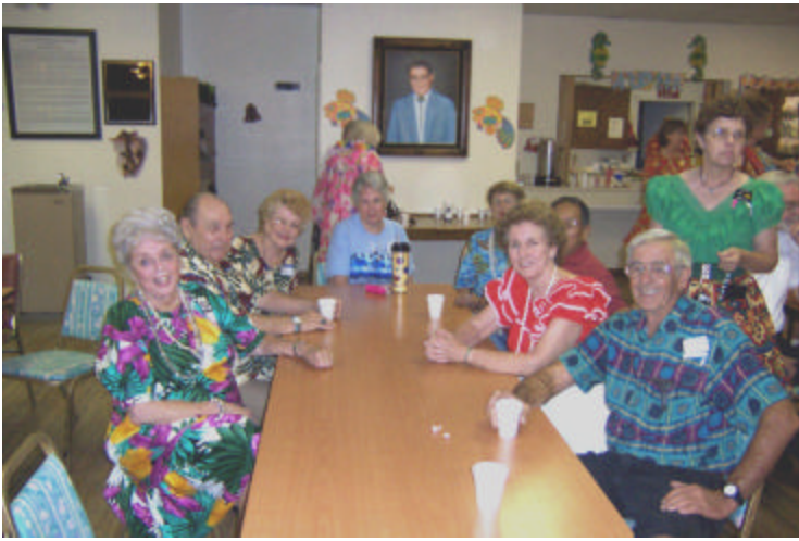
Gathering at the Luau Dance on July 15th